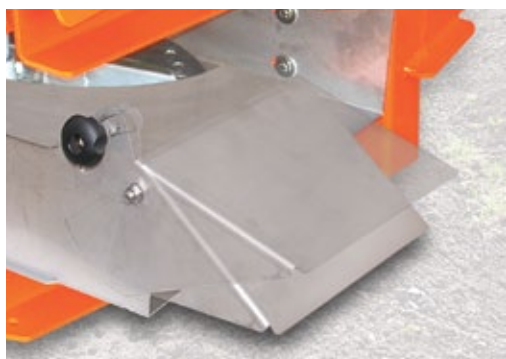
Adjustable side conveyors in stainless steel